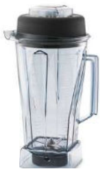
2.0 L Standard Container with Lid and Blade Assembly