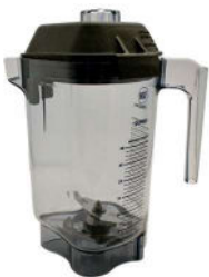
1.4 L Advance Container with Lid and Blade Assembly