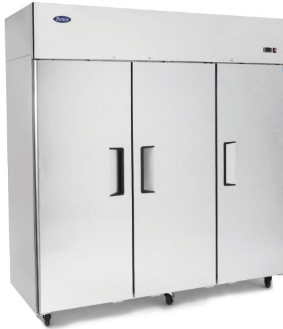
Top Mounted Three Door Refrigerator / Freezer