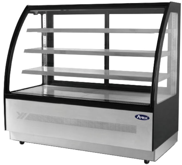
Four Tier Upright Curve Cake Showcase