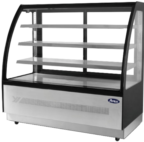
Four Tier Upright Curve Cake Showcase