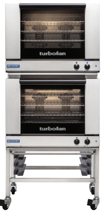
Model E28M4/2C shown

Full Size Manual / Electric Convection Ovens Double Stacked on a Stainless Steel Base Stand