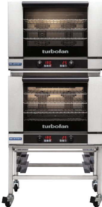
Model E28D4/2C shown

Double Stacked on a Stainless Steel Base Stand