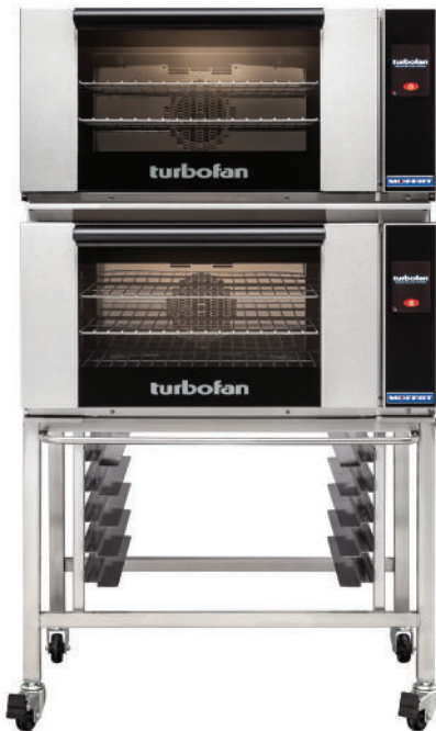
Model E27T3/2C shown

Full Size Electric Convection Ovens TOUCH SCREEN CONTROL Double Stacked on a Stainless Steel Base Stand