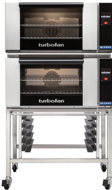
Model E27T2/2C shown

Full Size Electric Convection Ovens TOUCH SCREEN CONTROL Double Stacked on a Stainless Steel Base Stand