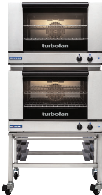
Model E27M2/2C shown

Double Stacked on a Stainless Steel Base Stand