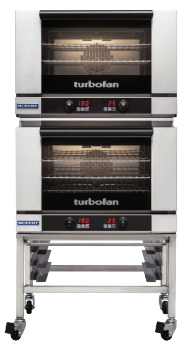
Model E27D3/2C shown

Full Size Digital / Electric Convection Ovens Double Stacked on a Stainless Steel Base Stand