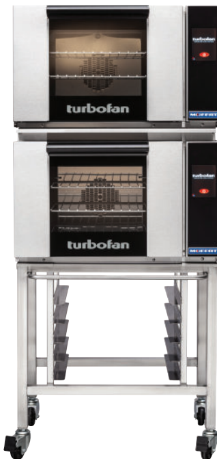
Model E23T3/2C shown

Half Size Electric Convection Ovens TOUCH SCREEN CONTROL Double Stacked on a Stainless Steel Base Stand