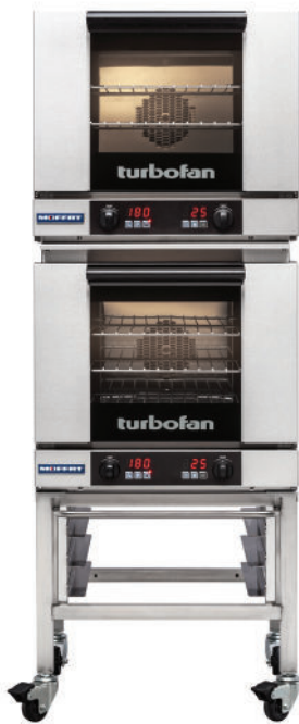
Model E23D3/2C shown

Half Size Digital / Electric Convection Ovens Double Stacked on a Stainless Steel Base Stand