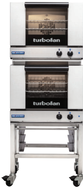
Model E22M3/2C shown

Double Stacked on a Stainless Steel Base Stand