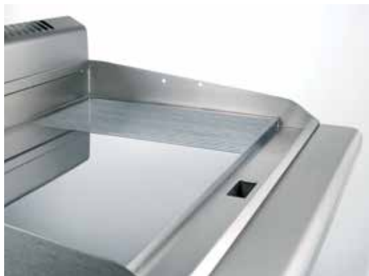
Mirror chromed griddle plate with a combined smooth and ribbed surface.