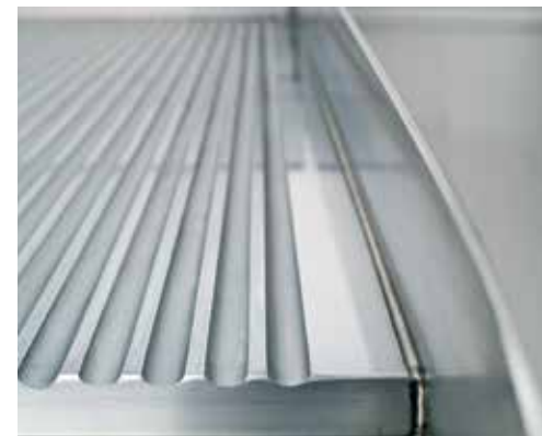
The 3mm splashguard is a fully welded hob surround providing extra durability.