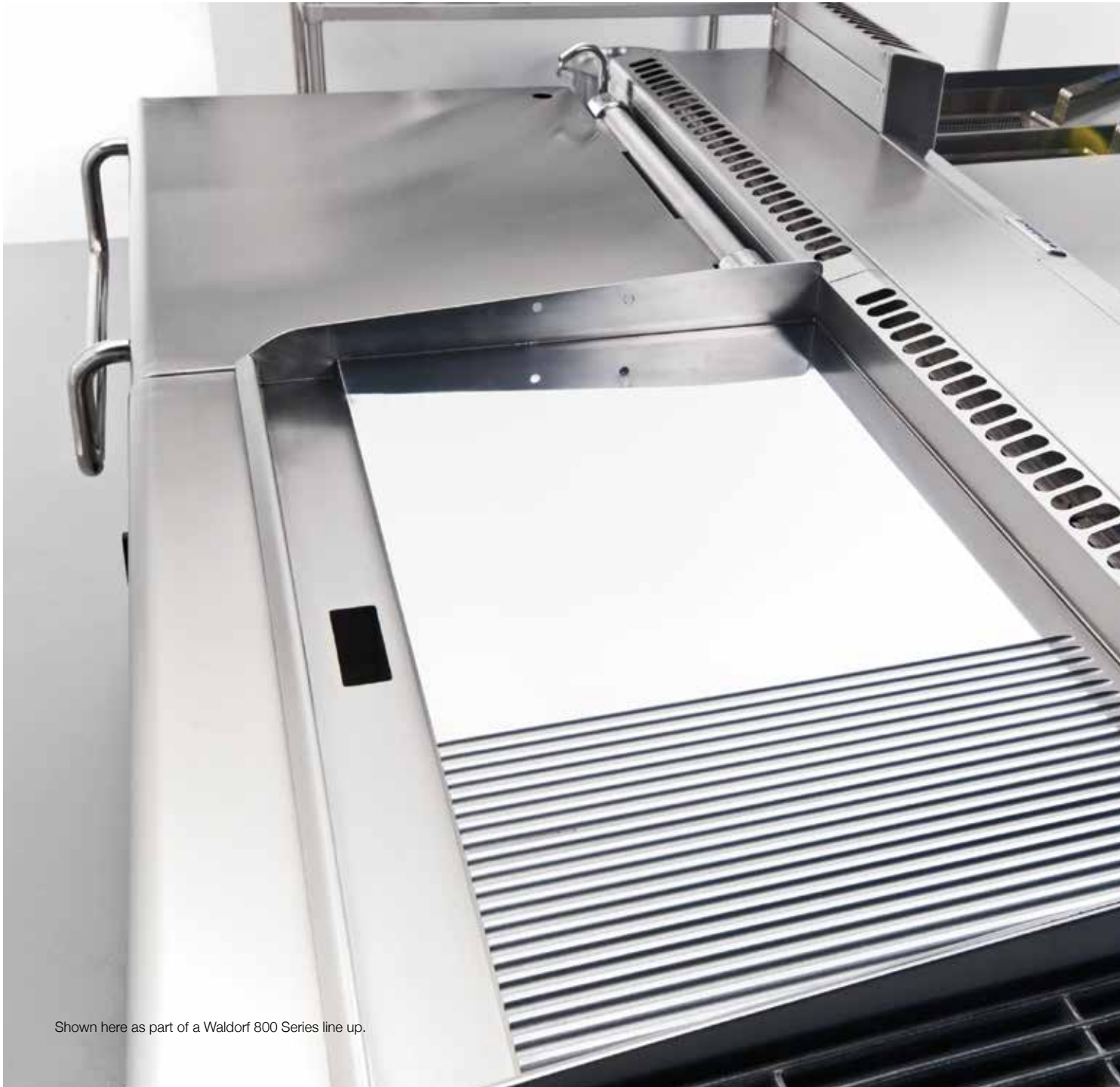
Shown here as part of a Waldorf 800 Series line up.