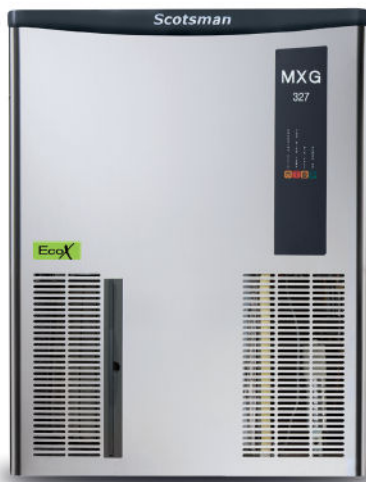
Medium gourmet cube 20g, 30mm dia x H 34mm