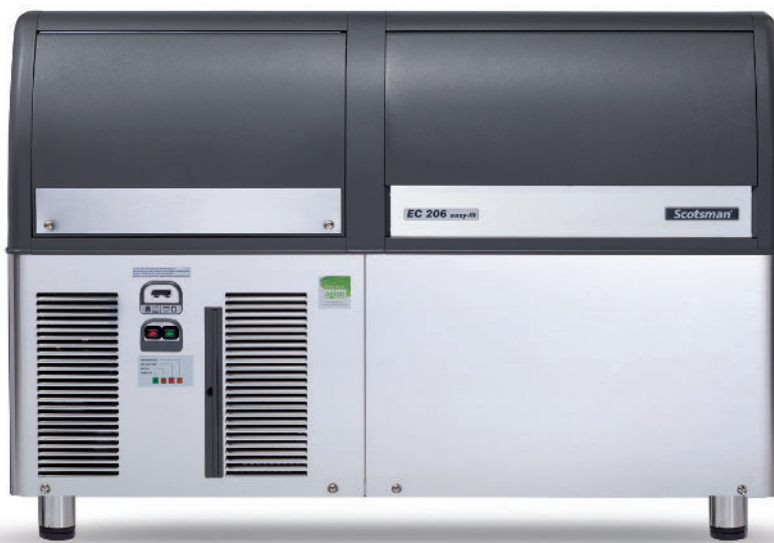
Small gourmet cube 8g, 21mm dia x H 25mm