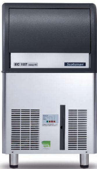
Medium gourmet cube 20g, 30mm dia x H 34mm