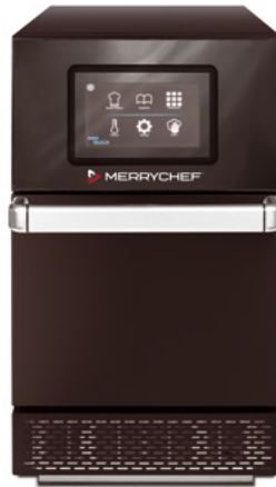
conneX12 B SP