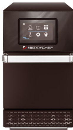
conneX12 B HP