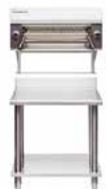
CS9 / C900-S