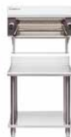
CS9 / C900-S