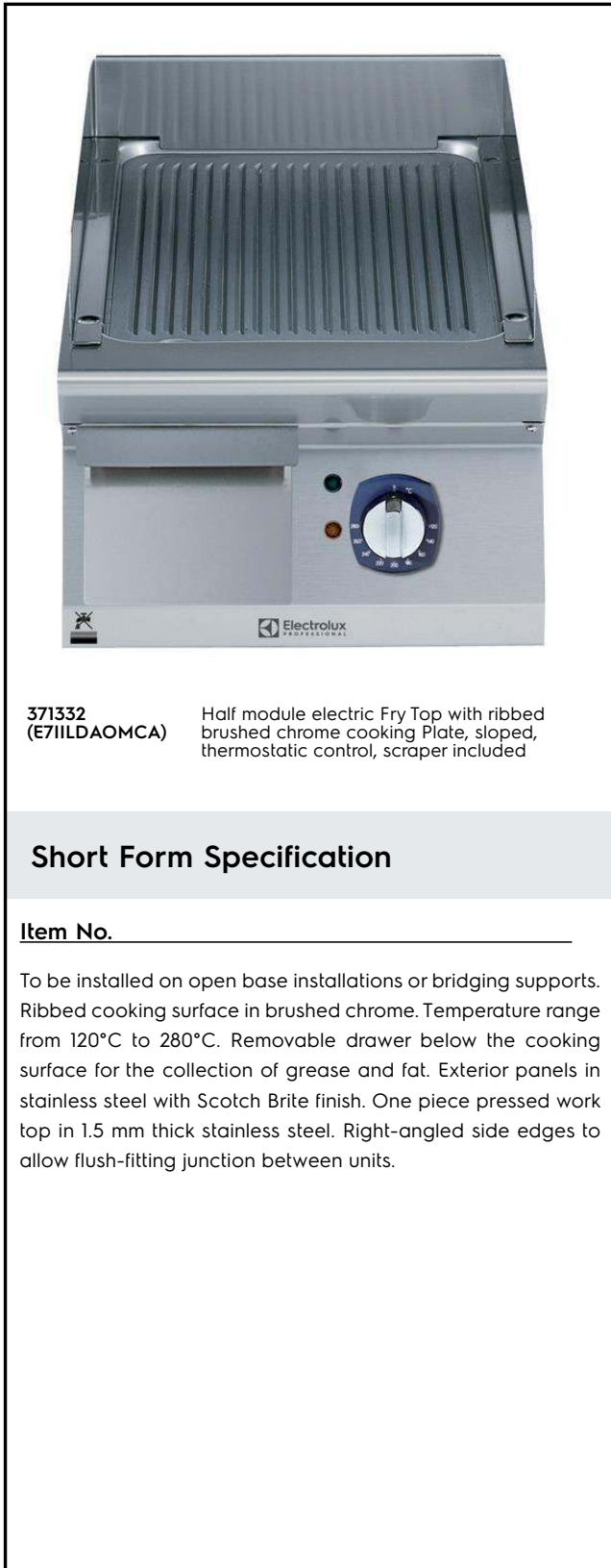
371332 (E7IILDAOMCA) Half module electric Fry Top with ribbed brushed chrome cooking Plate, sloped, thermostatic control, scraper included

700XP 400mm Electric Fry Top, Ribbed Brushed Chrome Plate Modular Cooking Range Line