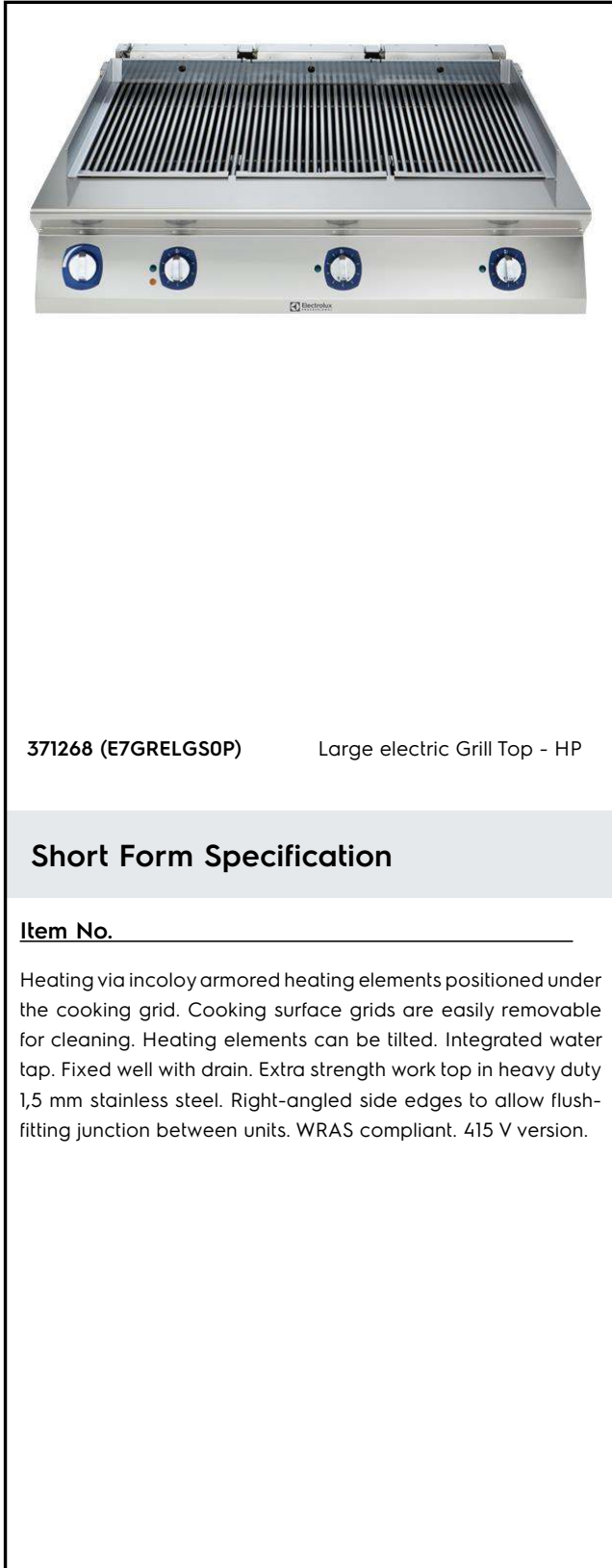
371268 (E7GRELGS0P) Large electric Grill Top - HP

Modular Cooking Range Line 700XP Electric Grill Top HP 1200mm