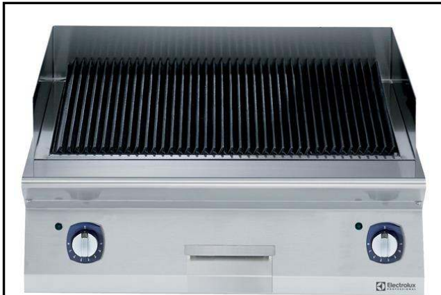
371240 (E7GREHGS0U) Full module electric Grill Top