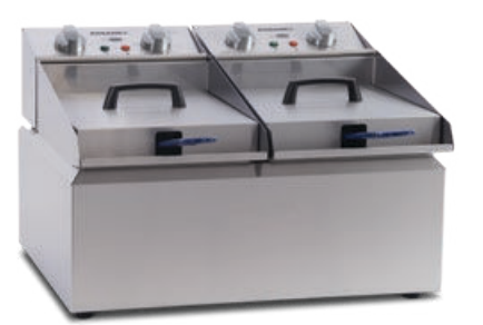
FR28 with pan covers