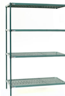
Four Shelf Add-on Unit (includes "S" hook brackets)