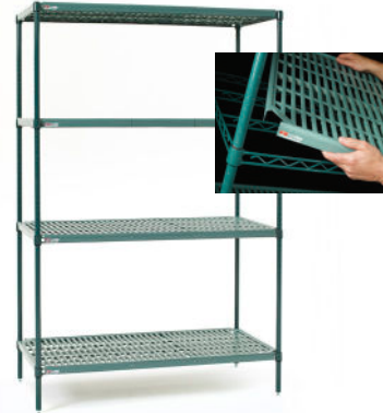
Four Shelf Starter Model

NOTE: Not suitable for cart wash applications.