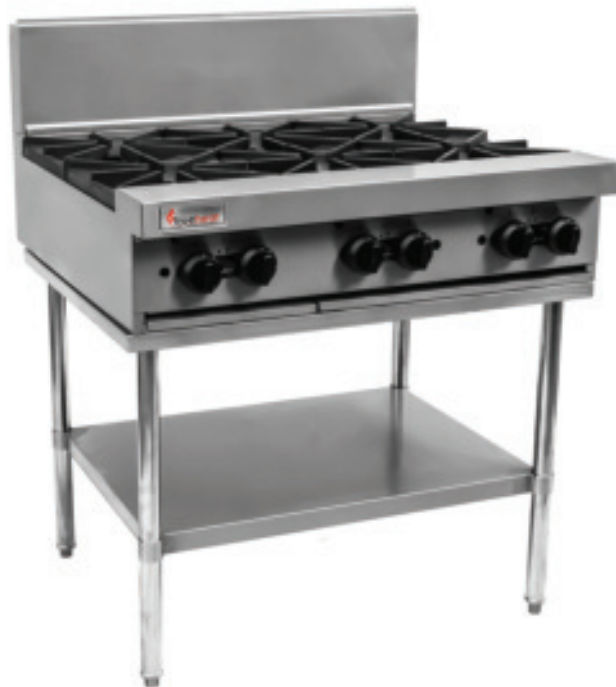
Stand sold separately

Note: Stands fitted with castors will need to be cut down by 120-150mm.