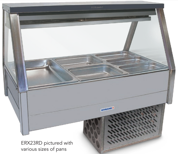
ERX23RD pictured with various sizes of pans

See pages 40 - 42 for all optional accessories.