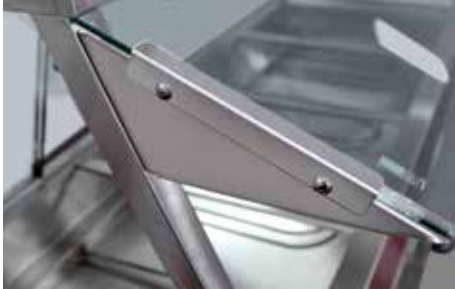
Optional sneeze guard

The Woodson self serve hot food display is perfect for buffet situations, back of house applications, or anywhere that serviceability is a key factor.