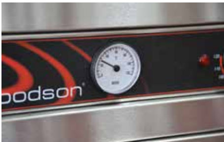
Precise thermostat control