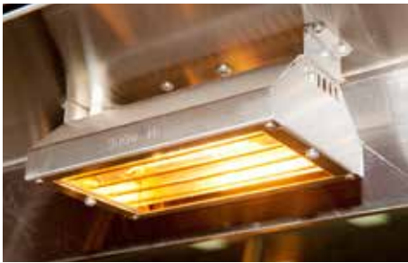
Quartz infra-red overhead heat lamps