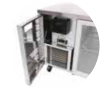
Removable refrigeration cassette