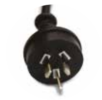
10 Amp power

The Australian made Boronia Star self-contained fridges have been designed for the testing demands of busy venues to operate efficiently, to maintain temperature as products are taken out, stock replenished and doors continually opened and closed. The units are available in one to four door counters, manufactured in stainless steel or hard wearing black coated steel. Glass door units with LED lighting ensure an attractive display, while adjustable shelves enable different sized bottles and cans to be stored efficiently.