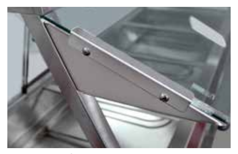
Optional sneeze guard

The Woodson self serve hot food display is perfect for buffet situations, back of house applications, or anywhere that serviceability is a key factor.