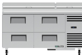
Straight-On Front View