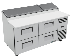
Front Left View