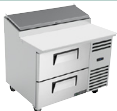
Front Left View