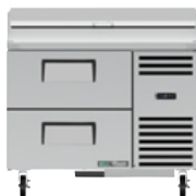
Straight-On Front View