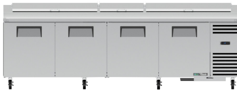
Straight-On Front View